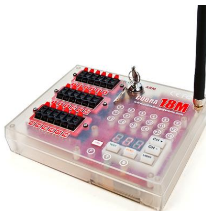
18M Firing Module